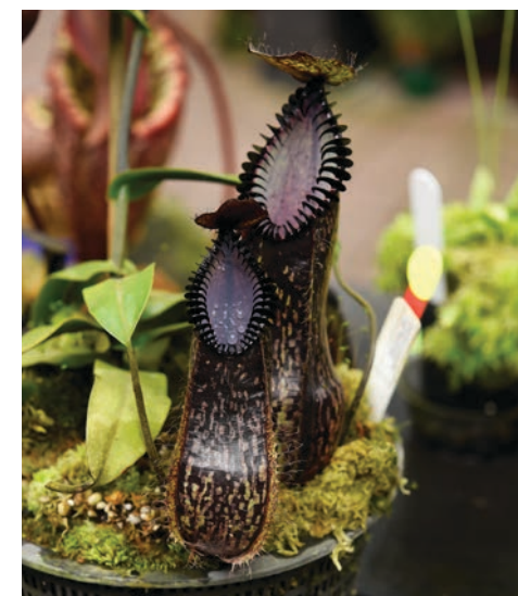
Beautiful dark pitchers of Nepenthes hamata .