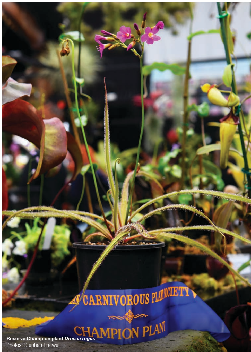
Reserve Champion plant Drosera regia.