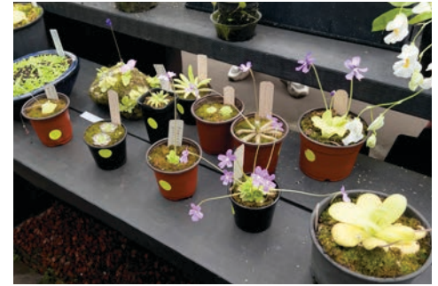
The Pinguicula display.