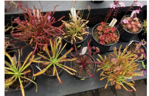
Drosera capensis varieties.