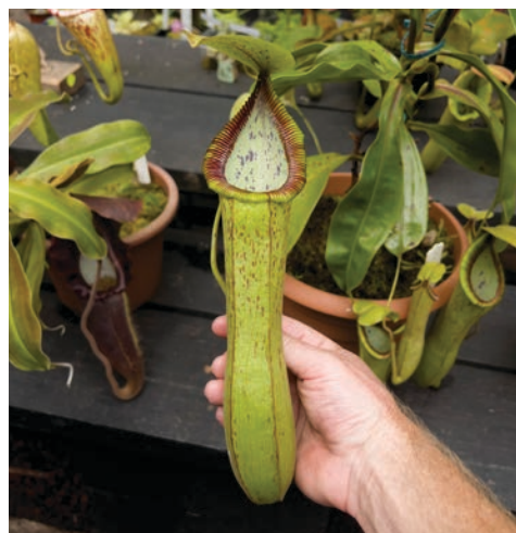
Largest Nepenthes pitcher, N. 'Predator' 28cm.