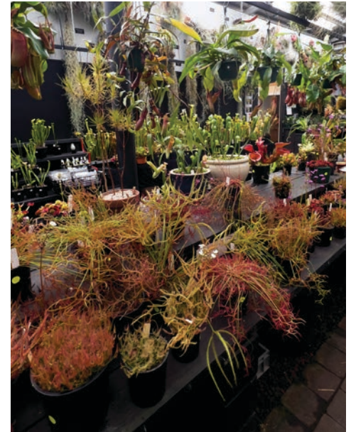
The Drosera binata display.