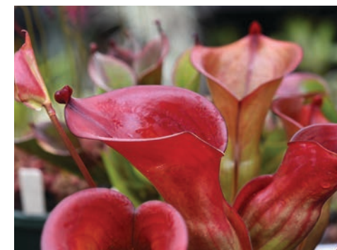
Vivid bright red pitchers of Heliamphora ionasii .