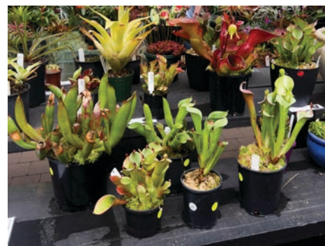
The Heliamphora display.