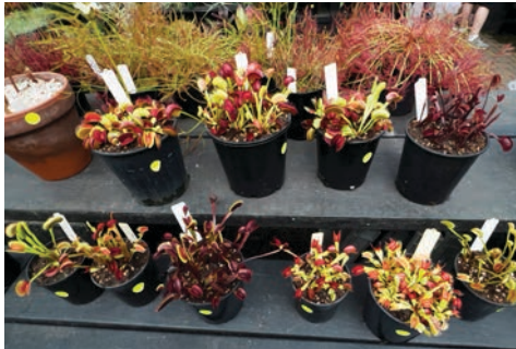
The Dionaea muscipula display.