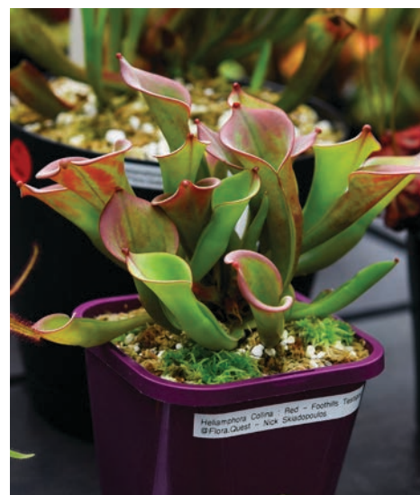
A stunning plant of Heliamphora collina .