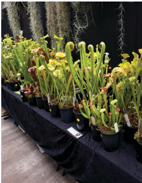
The Sarracenia display.