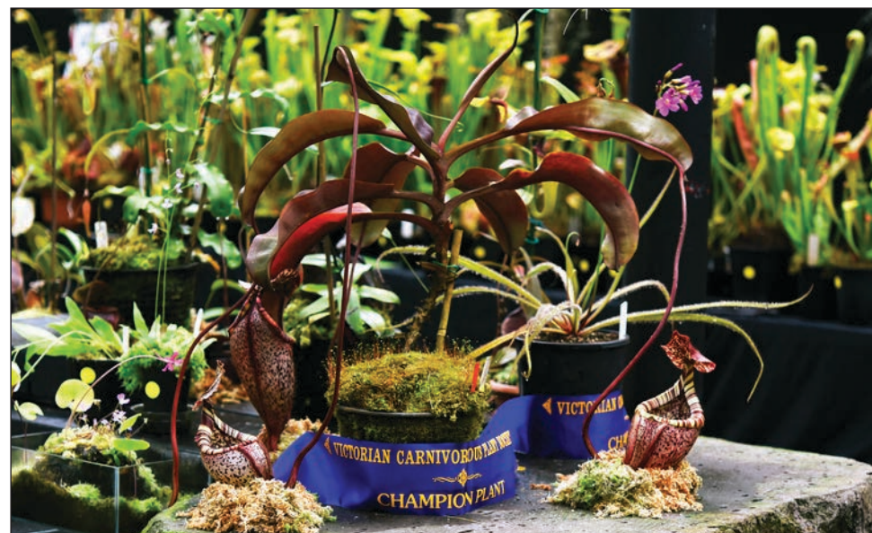
Nepenthes burbidgeae (left) the Grand Champion plant and Drosera regia the Reserve Champion.