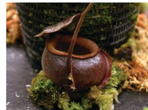
A super squat lower pitcher of N. undulatifolia .