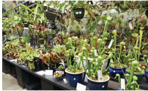
The Darlingtonia and Heliamphora displays.