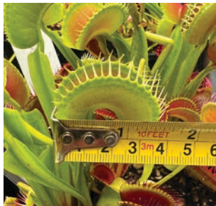
Largest D. muscipula trap: 4.2cm D. muscipula 'Bimbo'.