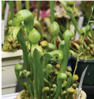
Darlingtonia californica .