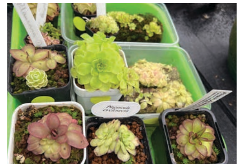
Various Pinguicula on display.