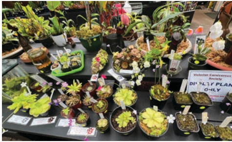
The Pinguicula and Utricularia displays.