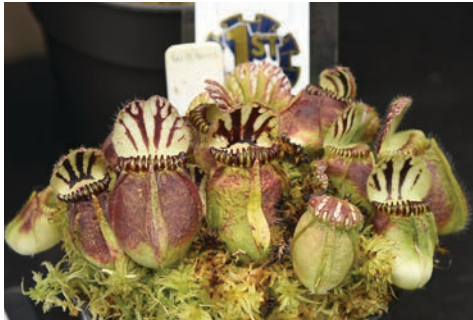
Cephalotus follicularis 1st prize plant.