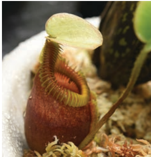
Nepenthes villosa .