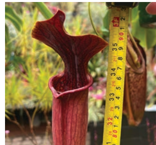
Largest Sarracenia pitcher: 93cm S. alata var flava var. rubricorpora .