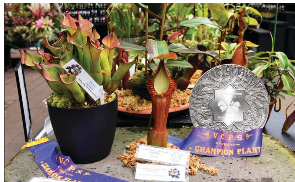
Nepenthes edwardsiana (middle) the Grand Champion plant and Heliamphora sp. Akopan the Reserve Champion.