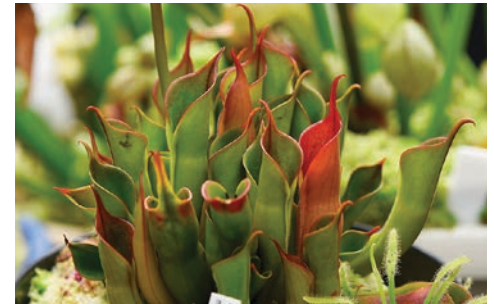
Heliamphora sarracenioides x minor (Burgundy Black).