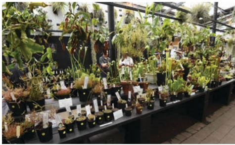
The Drosera and Sarracenia displays.