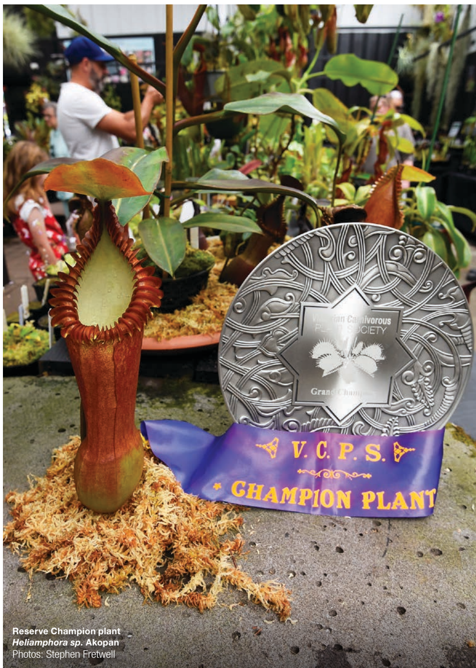
Reserve Champion plant Heliamphora sp. Akopan