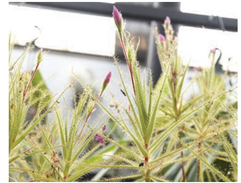
Roridula gorgonias .