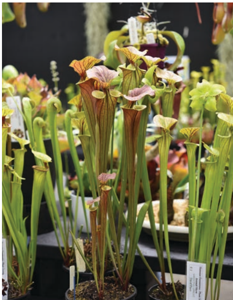
The Sarracenia flava display.