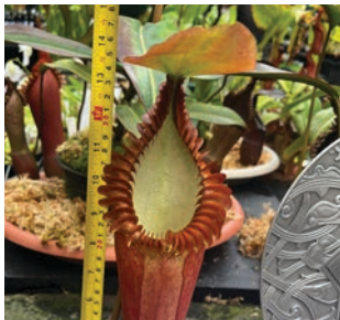
Largest Nepenthes pitcher: 34cm N. edwardsiana .