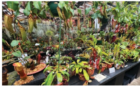
The Nepenthes display.