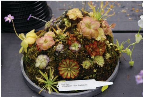
Lava rock planting, 1st place winner in 'Best Display'.