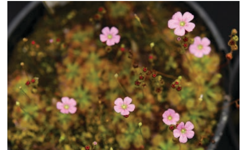
Drosera pulchella (Pink flower form).