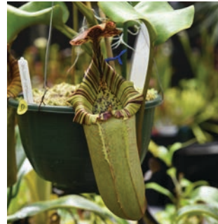
N. truncata x veitchii .