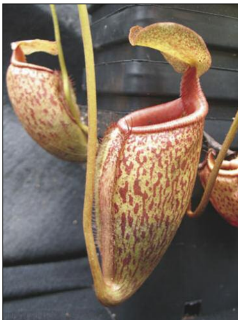
Nepenthes talangensis x mira