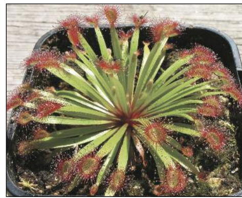
D. dilatato-petiolaris "Tiwi-Sand fly alley"

I have decided to use plastic pots, 9 - 10 cm diameter, placed into an aquarium that is 50 x 30 cm. For growing medium I use a mixture of 1:1 perlite and white peat. Please note that only a peat to which no fertilizer has been added is suitable. Alternatively you can use coarse quartz sand which of course is a lot heavier. Besides that I use the following additives at approximately 1 teaspoon per litre of mix: clay (both finely ground as well as coarser), vermiculite and laterite. In their natural environment some varieties grow in laterite soil that contains iron, therefore I would like to have a greater iron content in my mix. Recently I have been experimenting a bit and arrived at the conclusion that clean coarse pieces of fine coconut fibre without added fertilizer are also suitable additions to the