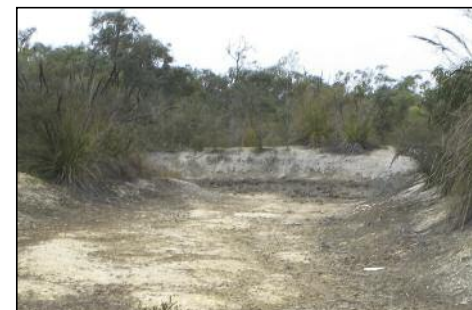
What's left of the main pond from the Cranbourne swamp in 2007.

It is possible that if conditions were to change for the better it may take only a few seasons for the plants to regain their former glory. This is not likely to happen though as a C.S.I.R.O.