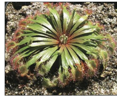
D. aff brevicornis "Theda, Kimberley, NT"

I keep the plants damp but not wet all year but I watch that in winter they do not stand in water. Since the sun is very strong in Australia the plants need high light levels in cultivation. In summer my aquarium is often in full sun on my balcony. In winter it is on a shelf in my flat under 2 x 15 watt fluorescent lights. At that time the terrarium is almost completely covered by light and warmth reflectors. This way I hope I can reduce any unnecessary heat loss into the room and increase the light intensity. So as to reduce the danger of botrytis infection in this damp environment I have hung a small PC fan in the aquarium that changes the air at least every half hour. The temperature should be