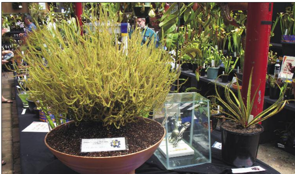
The Grand Champion and Reserve Champion plants at the 2007 VCPS annual show.