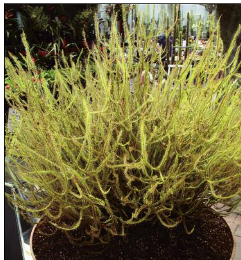
Drosera binata var. dichotoma "f. large"