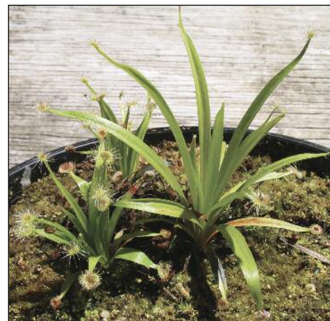
D. caduca "Backsten Creek"