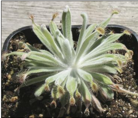
D. ordensis "South Kingston Rest"