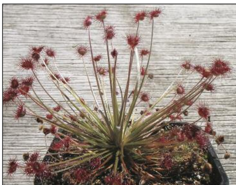
D. paradoxa "Swamp form"

the Kimberleys. Otherwise the temperature only rarely drops below 17°C.