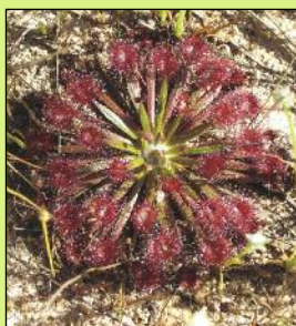
FRONT COVER: Drosera fulva photographed in the wild near Darwin.

The articles that are found within are copyright but can be copied freely if the author and source are acknowledged. The views are of the authors and are open to review and debate. Please send all material to the editor for consideration to be included in our quarterly journal.