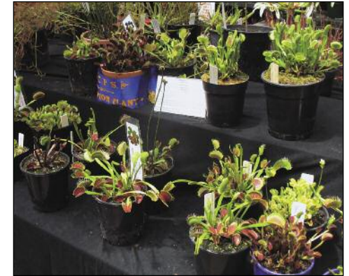
The VFT display.