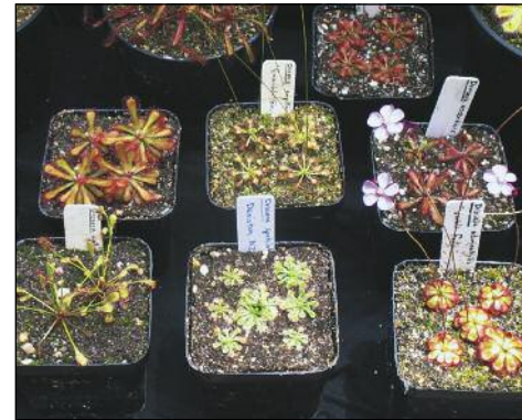
Unique Drosera, that are rare in cultivation.