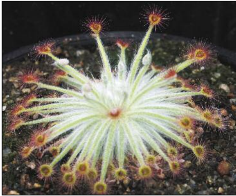
D. lanata