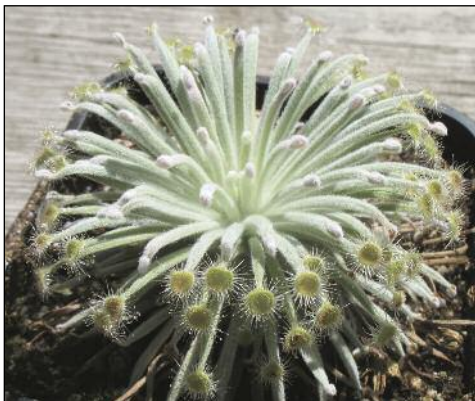
D. derbyensis

that some types need this treatment that imitates the natural change between rainy and dry periods. The seedlings grow quite fast under good conditions and it is possible to prick them out into fresh potting mix.