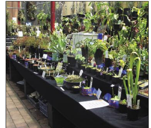
Utricularia and Pinguicula display.