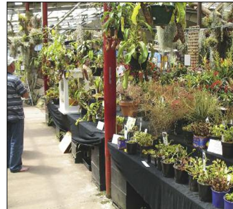
The Nepenthes and VFT display.